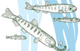
幼魚群游之展示(1~5月) Exhibition of large-school salmon fry (January - May)