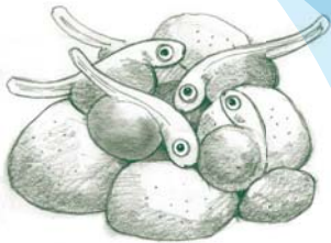
幼鮭之展示(11~2月) Exhibition of salmon babies (November - February)

從前豐平川即是許多鮭魚回游的河川。但隨著札幌的發展，河川的水日漸污染，鮭魚曾一時消失蹤跡。之後，因全民發起的拯救鮭魚回游運動而豐平川才又重現鮭魚回游情景。鮭魚科學館裡介紹了象徵札幌的豐平川野生鮭魚生態。The Toyohira River has long been a common place for chum salmon to return to. The river, however, became contaminated as Sapporo developed, and no salmon were seen for some time. They began to appear again in the river as a result of the Come Back Salmon program conducted by citizens. The Sapporo Salmon Museum introduces wild salmon that swim powerfully in the Toyohira River, a symbol of the city.