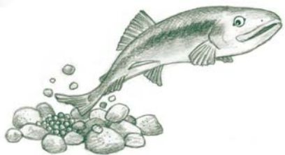
產卵行動之展示(10~11月) Exhibition of spawning salmon (October - November)